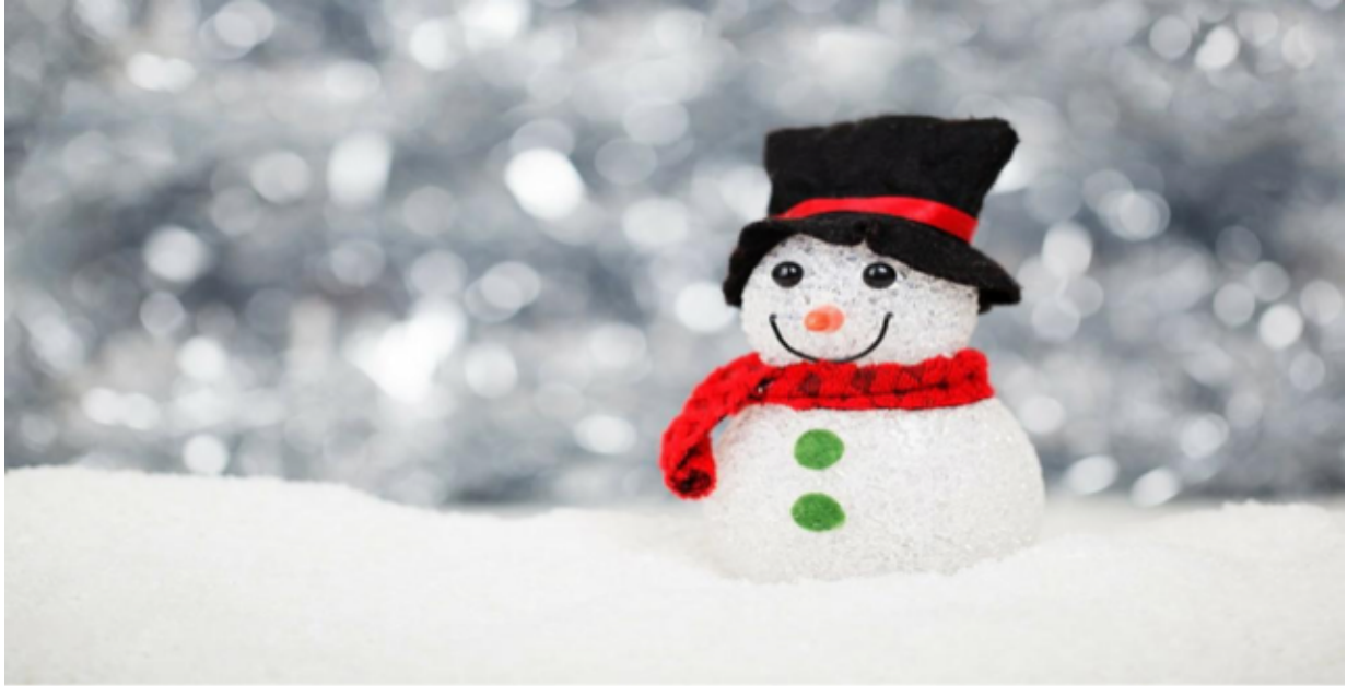
2020 An Interesting Year To Remember the GOOD - as we wish you a Merry Christmas!